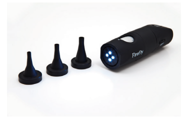
IMAGE AND VIDEO CAPTURE

DE570 empowers healthcare professionals with a whole new perspective. Its advanced technology can quickly provide a high-definition image for quick and accurate diagnosis.